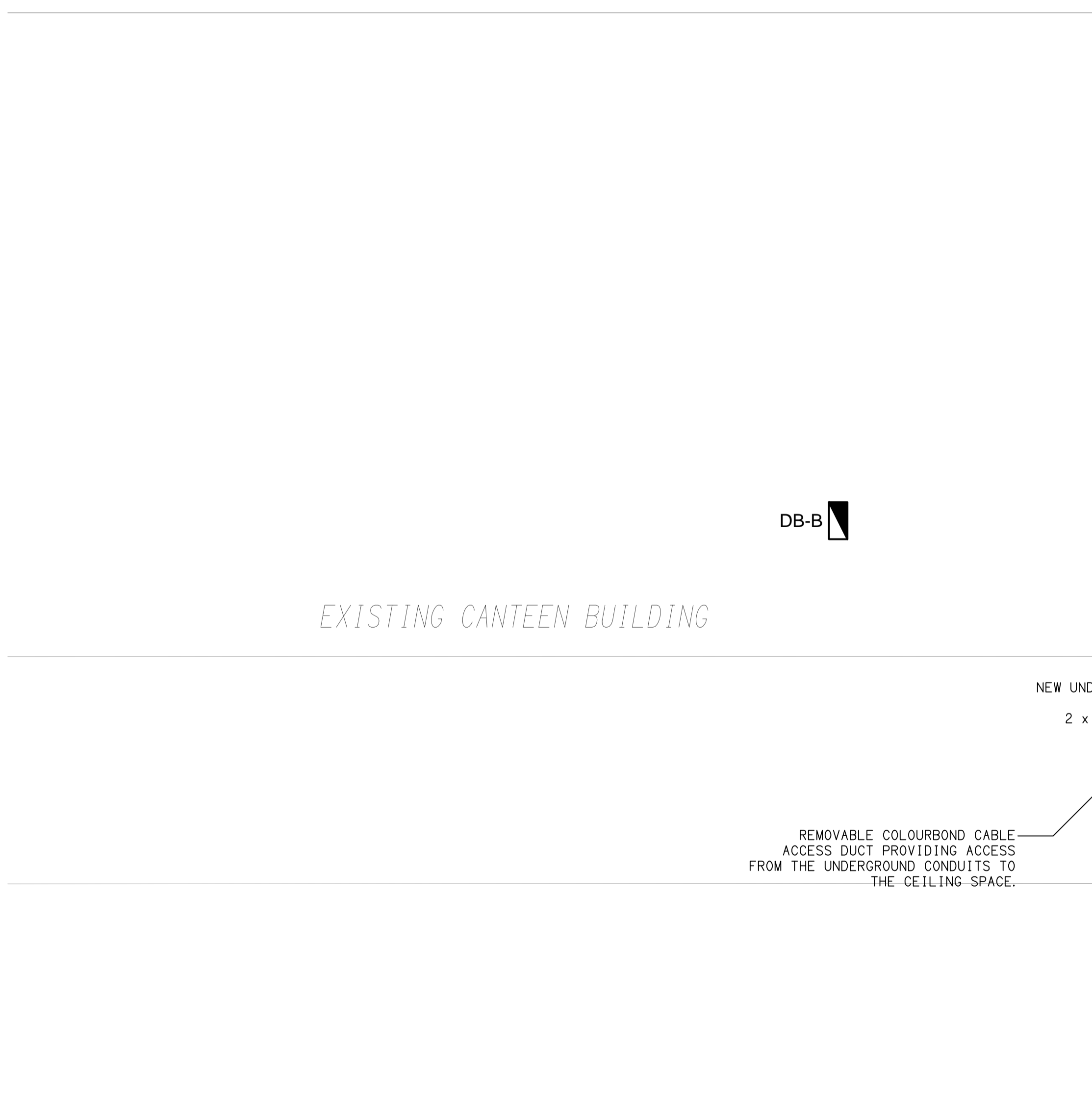
FLOOR PLAN AMENITIES BLOCK UPGRADE SCALE 1:50

ELECTRICAL DESIGN GROUP BRISBANE PTY LTD ACN 092 710 793 TRADING AS: ELECTRICAL DESIGN GROUP